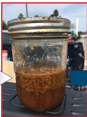
Sample after being quickly agitated (shaken). The Paraffin can be pumped at this point and will continue to break down.