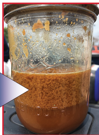
Paraffin continuing to break down into solution after only 7 minutes.